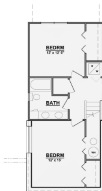
LOWER LEVEL FLOOR PLAN

MAIN LEVEL = 646 SF LOWER LEVEL = 646 SF TOTAL AREA = 1,292 SF