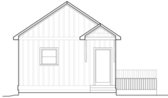
FRONT ELEVATION SCALE 1/8" = 1'-0"