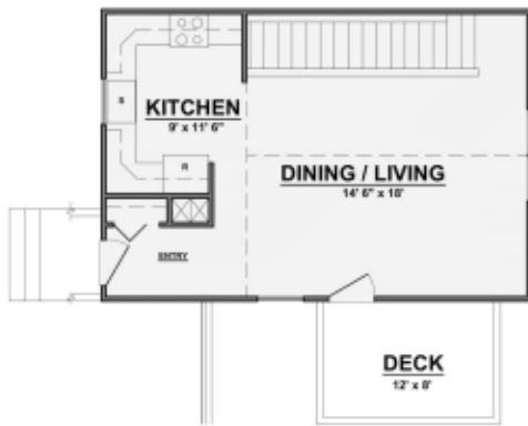
MAIN LEVEL FLOOR PLAN SCALE 1/8" = 1'-0"